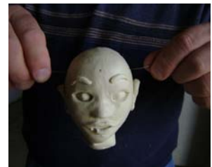
Balancing the head.