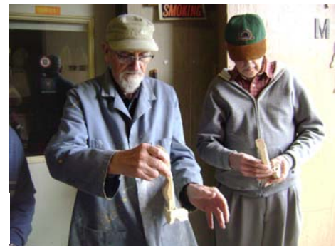
Checking the knee joint