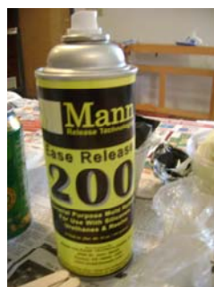
The mold needs to be sprayed with a release spray before pouring the Alupalite.