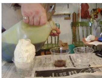
Mixing the 2 liquids