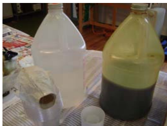
Alupalite consists of 2 liquids