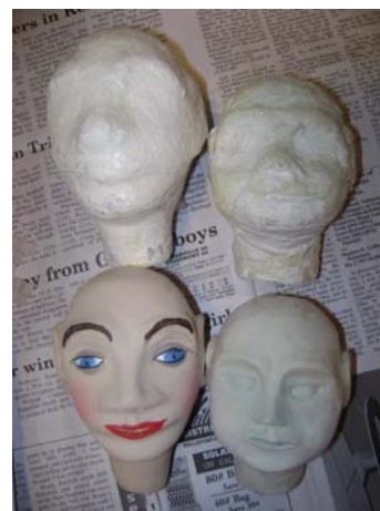
Heads sculpted, cast, and painted by Beulah